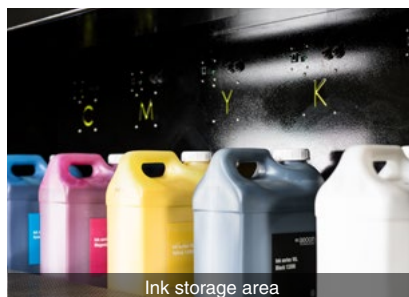
Ink storage area